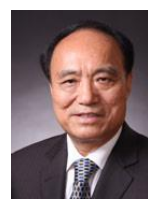
HOULIN ZHAO ITU Secretary-General